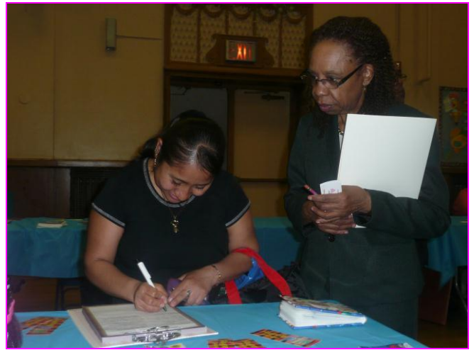
Reaching out to the community.

itself and its services to the Harlem community. We also had an opportunity to learn more about the services and programs that are provided in the Harlem community, and establish new partnerships with established organizations.