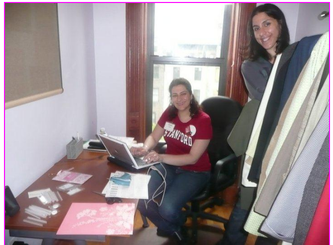
Volunteers keep us organized.

The Relief Boutique welcomes volunteer assistance from all interested in supporting our mission. Contact us at info@reliefboutique.org or visit our website at www.reliefboutique.org to learn more about volunteering at The Relief Boutique.