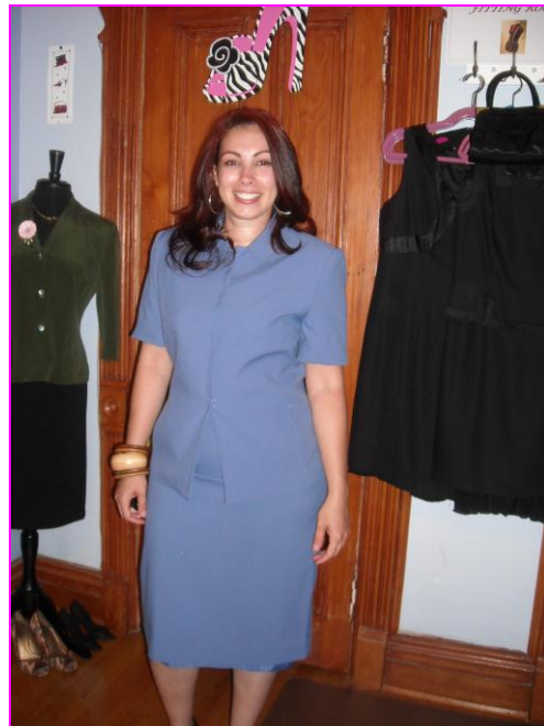
The finished look.