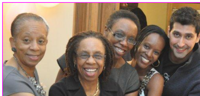
The Board at The Relief Boutique Kickoff Party