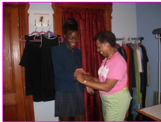
Fitting a client.

There is no denying the positive impact of proper professional attire for women seeking employment. By providing personal service and professional attire to our clients, we assist them in building confidence, a positive attitude and high self-esteem -- traits essential to successful employment and professional advancement.