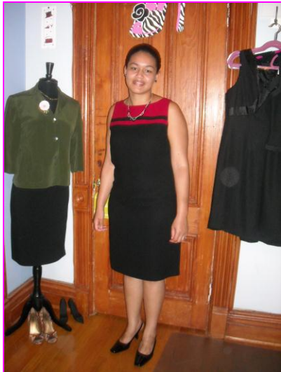
Ready for work.

After our kickoff party in December 2010, The Relief Boutique began operations, servicing our first clients in March 2011. To date, we have successfully prepared over 75 women for interviews and employment in areas as diverse as medicine, law, office administration, security and food services. In addition, many of our clients have been prepared for job fairs and educational opportunities. We provide each client with two business outfits, shoes, a handbag and accessories, along with care, encouragement and guidance on maintaining an appropriate look.