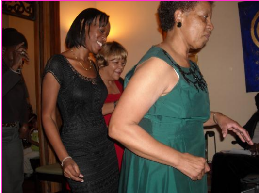
Board members having fun

On December 3, 2011 we celebrated our one year anniversary in style with our second annual fundraising event. The highlight of the evening was a fashion show featuring our clients in their professional clothing.