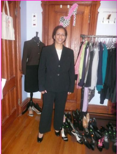
Sleek and professional (and get a load of her shoe options!)

women prepare for success, not only with the proper clothing, but also with the proper attitude and level of self-confidence. In 2012, we look forward to seeing more clients, making more partners, holding and attending more events, and providing even more clothing and caring to women in need.