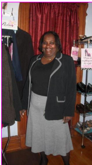
Confident and prepared