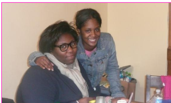
Our high school volunteers bring great energy to The Relief Boutique